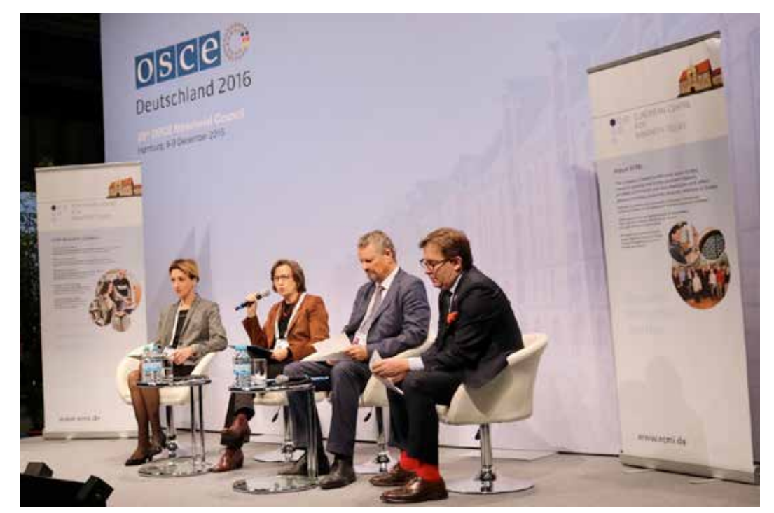
Bridge Building and National Minorities: OSCE Ministerial Council Side Event. 9 December 2016, Hamburg

[For more information, please visit the Project page at www.ecmi.de/clusters/projects/bridge-building-and-integrationin-diverse-societies/]